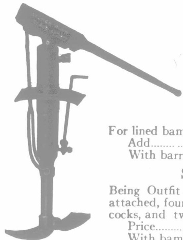
No. 2—Outfit A

Won highest award at St. Petersburg, Russia, over all Canadian, French and German Pumps. Also secured first place at Manchester (England), Toronto, Ottawa and Halifax.