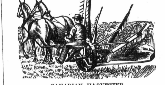
CANADIAN HARVESTER. Adapted to all kinds and conditions of grain. LIGHT DRAFT ADJUSTABLE TRACK, instantly adapted to LOGGED GRAIN. Guaranteed as represented, or money refunded.