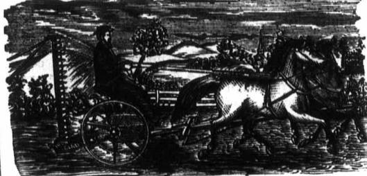
"IRON-CLAD" MOWER. Warranted First-Class. Has no superior in the World.

Awarded the only International Prize Medal, and also Silver Medal at the Centennial, given to Canada for Mowers and Reapers.