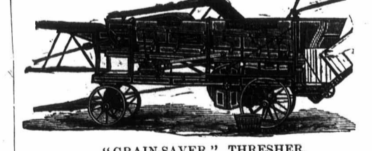
"GRAIN-SAVER" THRESHER, Warranted Superior to any in the Market. Send for Illustrated Catalogue. Address— L. D. SAWYER & CO., Hamilton, Ont. DB-12