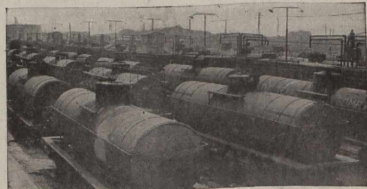
“Imperial Asphalts can be quickly delivered to any part of the Dominion. They come in tank cars or packages, whichever is best suited to your requirements.”

“There are three Imperial Asphalts for road purposes, Imperial Paving Asphalt for preparing Hot-Mix Asphalt (Sheet Asphalt, Bitulithic, Warrenite, or Asphaltic Concrete), Imperial Asphalt Binders for Penetration Asphalt Macadam and Imperial Liquid Asphalts for dust prevention and for increasing the traffic-carrying capacity of earth, gravel and macadam roads.”