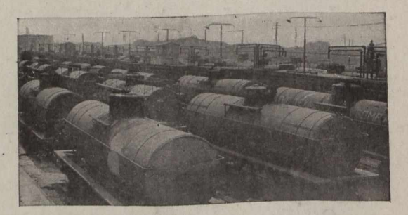
"Imperial Asphalts can be quickly delivered to any part of the Dominion. They come in tank cars or packages, whichever is best suited to your requirements."

"There are three Imperial Asphalts for road purposes, Imperial Paving Asphalt for preparing Hot-Mix Asphalt (Sheet Asphalt, Bitulithic, Warrenite, or Asphaltic Concrete), Imperial Asphalt Binders for Penetration Asphalt Macadam and Imperial Liquid Asphalts for dust prevention and for increasing the traffic-carrying capacity of earth, gravel and macadam roads."