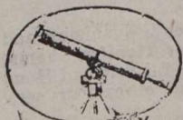
Registered Trade Mark.

Locks in all qualities for Cabinet Makers, Wash Fasteners, Locks & Brassfoundry for Builders' Ironmonger. ALL KINDS OF KEYS MADE on the PREMISES.