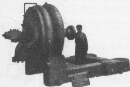
Worthington 2 Stage Turbine Pump for the Winnipeg Water Works, Capacity 5,000,000 per 24 hours.

We Have Two Stage Pumps in Operation Delivering Against 160 Pounds Pressure