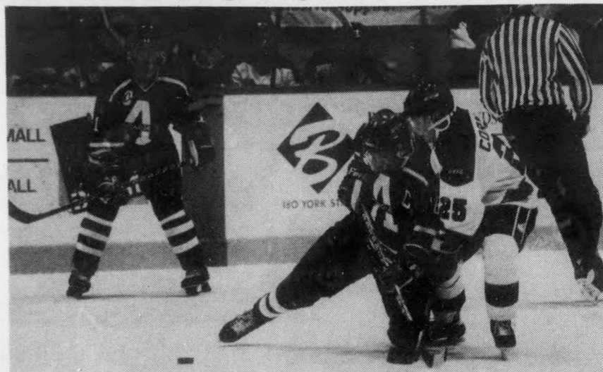
UNB puts the clutch on Acadia.