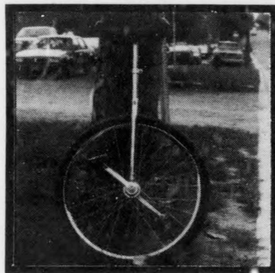
Uni Cycle - BA I

Send a copy to an ex-prof as part of his retirement package.