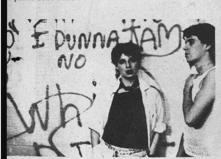
e picture, photog, and Bruthie here will stuff that Nikon in your