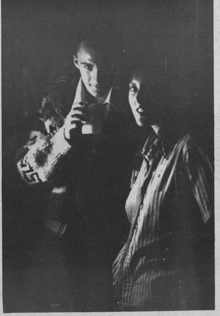
Here's looking at ya, kid.