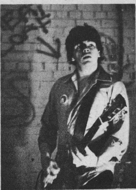
Who called me Meat-Loaf?