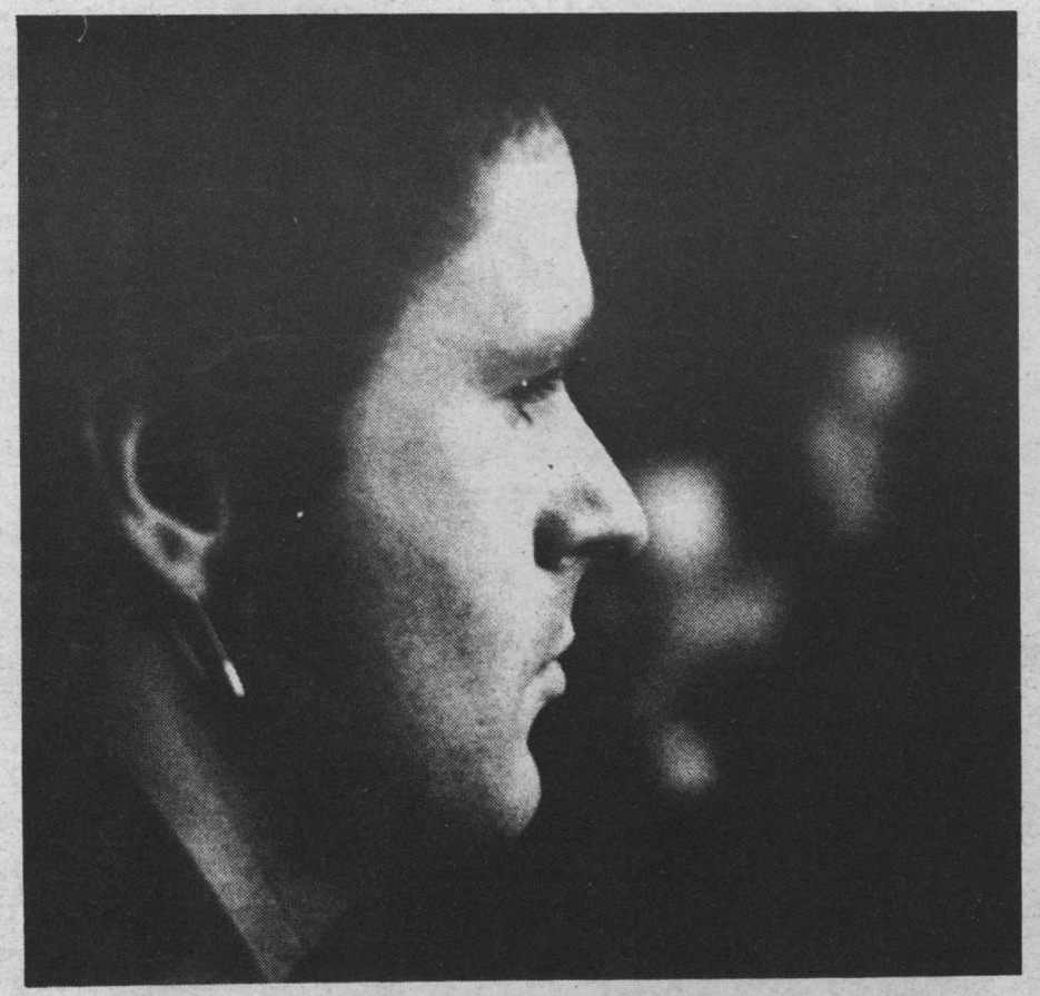
My ma missed when I was little.

thing else, much of the "Male Club" displays is nd interesting, in that bience of energy the atmosphere. It's nd it's raw, and for s is what we've been But remember, if you see the Female Hands leactors this weekend, not to smile. As I was all punks don't smile".