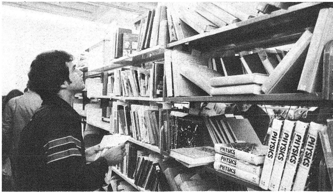
This enterprising student searched the shelves at the VCF Book Exchange looking for a bargain.