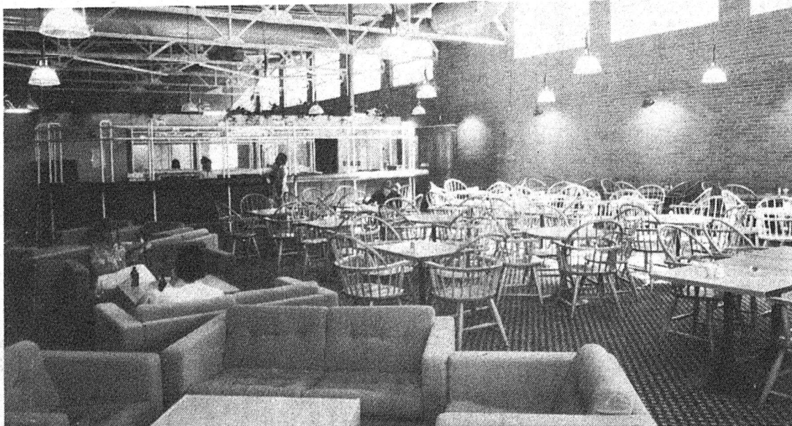
The early days of the grad student lounge. Remember when the food was good and the prices were reasonable?