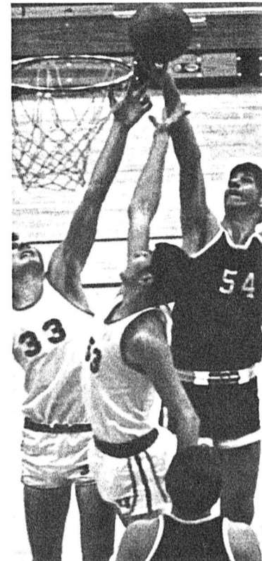
LOOK ... shaved armpits

Excitement was far from over yet, though. The Huskies rallied