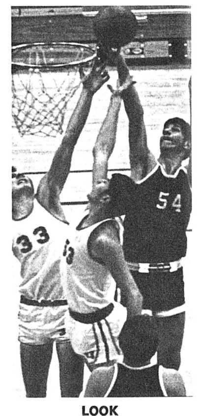
... shaved armpits

They came out in the second stanza still fired up. The fans screamed, whistled and fell over each other with glee. The Bears scored, scored and scored. After two minutes it was tie game, 43-43. In five minutes the Bears had outscored the Huskies 21-2. Excitement was far from over yet, though. The Huskies rallied