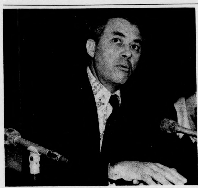
Harry Parrott, minister of colleges and universities