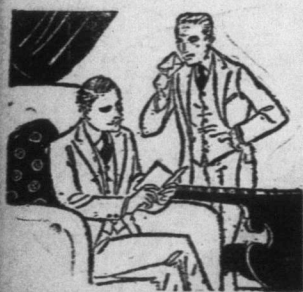
A GOOD APPEARANCE

Men's and Boys' Outfitters Stratford KITCHENER Hamilton.