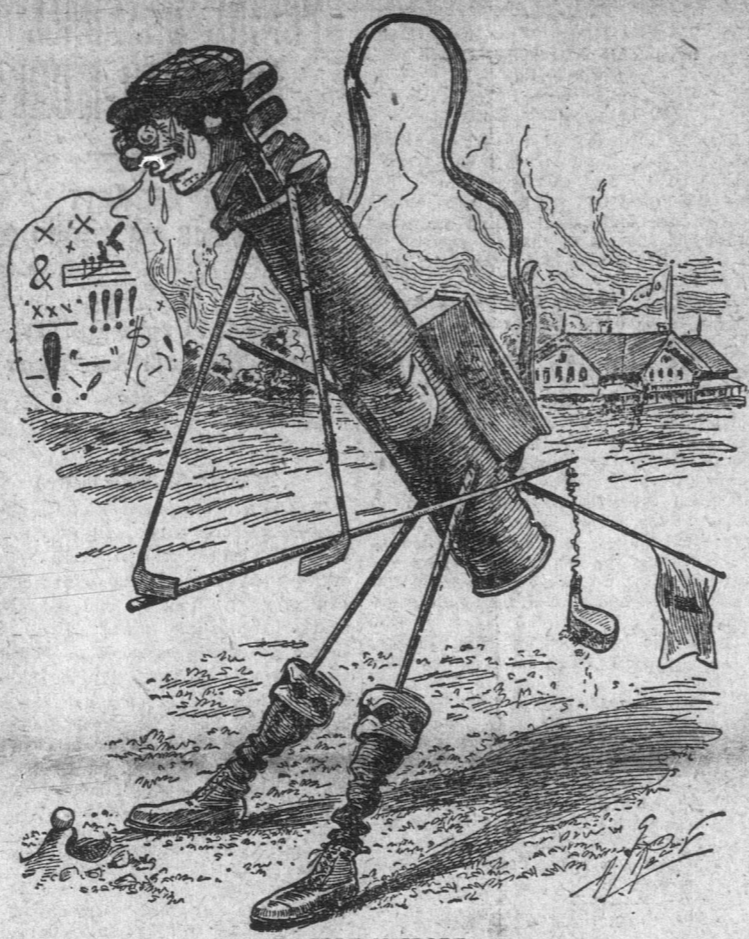
THE GOLF MICROBE.

The Hudson Bay Company now ruled practically the whole of North America. In 1870, however, it made a bargain with the Canadian government, and to this bargain is due the fact that its shares to-day stand at 700 per cent. premium.