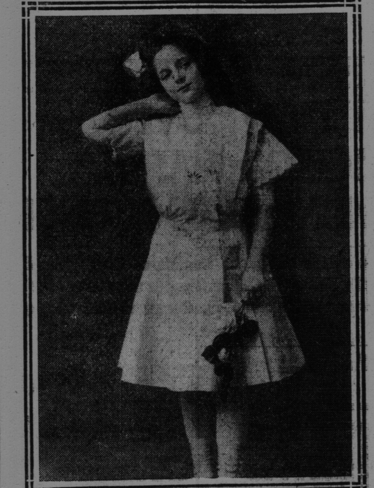
PIQUE FROCK WITH HAND-EMBROIDERY. The distinction and daintiness of this little frock will appeal to every mother...