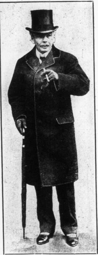
LATEST PHOTOGRAPH OF SIR STARR JAMESON (DR. JIM) THE INSTIGATOR OF THE JAMESON RAID IN SOUTH AFRICA.

Looked Beyond Him. Sad one (jauntily)--Would you like a nice partner for the next dance? Glorious one (innocently)--Why, yes! Bring him up.--Princeton Tiger. A Tightwad. Gerald: "Prattley is an awful tightwad!" Geraldine: "Is he?" Gerald: "I should say as much! He won't even tell a story at his own expense!"--Judge.