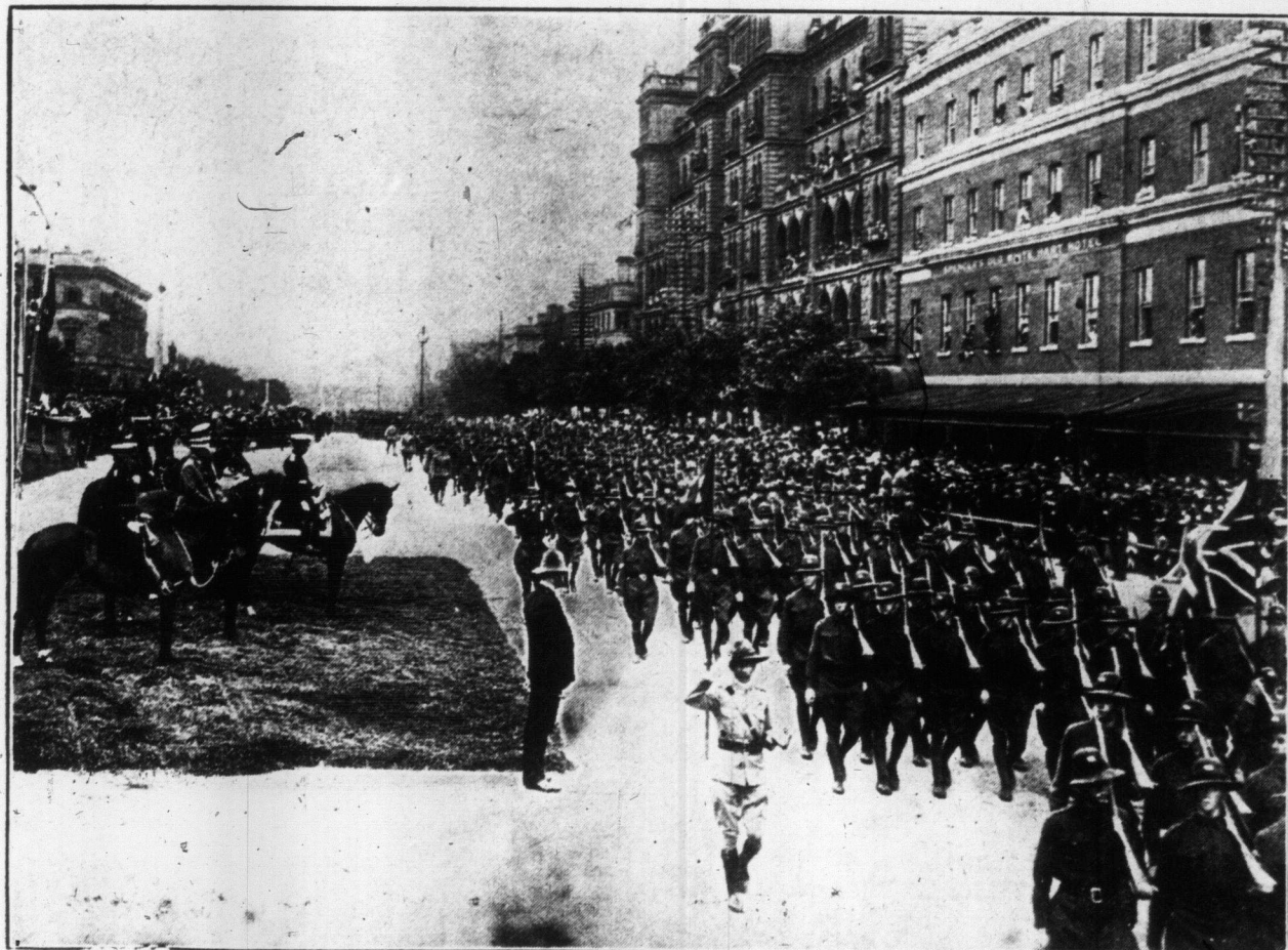
GREAT CADET PARADE IN MELBOURNE—ALL MELBOURNE TURNED OUT TO SEE 18,000 CADETS MARCH THRU THE CITY. PARADE PASSING LORD DENMAN, THE GOVERNOR-GENERAL, AT THE SALUTING STATION.