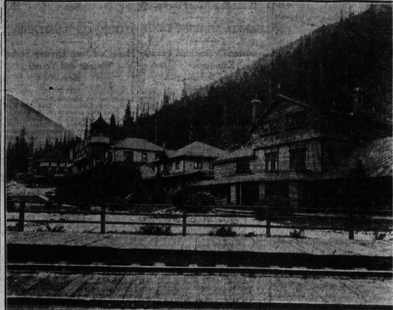
Glacier, B.C., under Mount Sir Donald, on the line of the C.P.R.