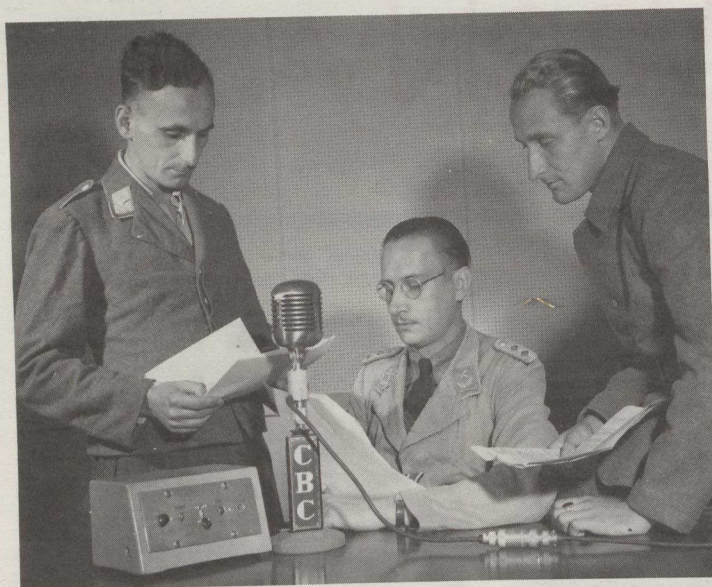
German prisoners of war broadcast messages home on international transmission service to Western Europe.