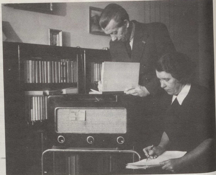
Listeners in Prague, Czechoslovakia copy messages from RCI program during the Second World War.