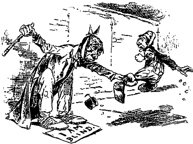
BLIND BEGGAR—"I reckon I got an eye to business yet, sonny."