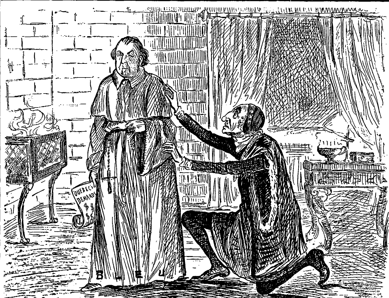
SCENE FROM "LOUIS XI."