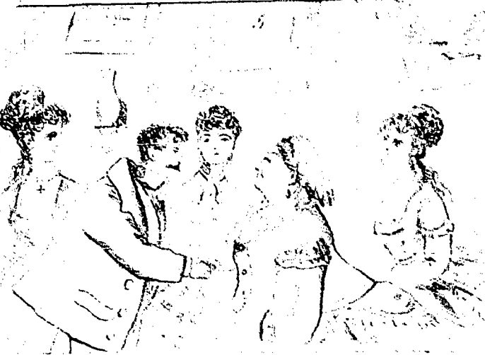
5. Conversational.—Chorus—"How do? Happy New Year! Same to you!! Charming day!!! (Snowing heavily all the time.) Have a glass of wine!!!! Good morning!!!!"—(4 p m.)