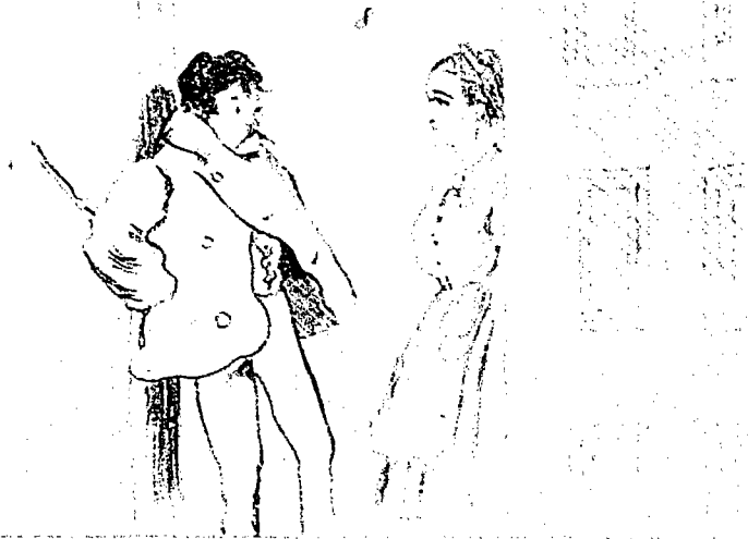
8. Am overcome by the effects of climate.