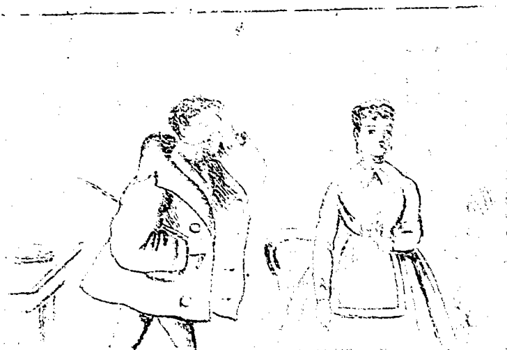
4. Final touch.