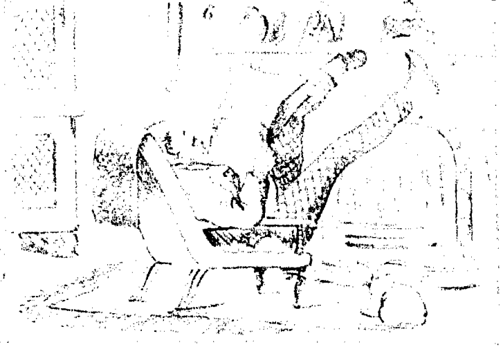
6. Where is papa all this time? Why, here he is in the parlour with the cat and the last Canadian Illustrated News.