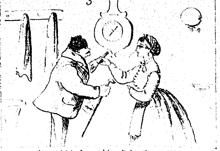
3. Am whisked (not kissed) by the pretty maid.