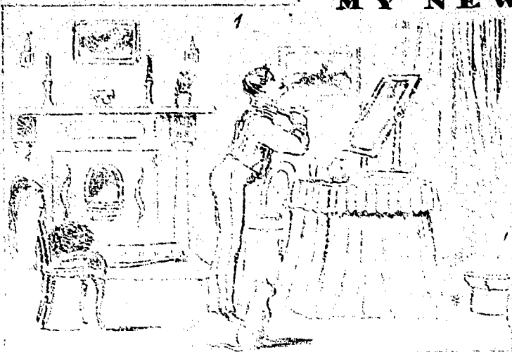
1. I get me ready, donning colours becoming, and Gibb's best suit.