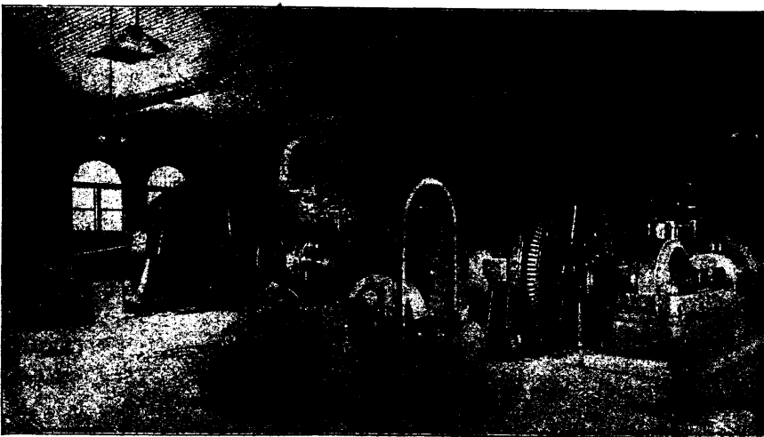
Two of our Engine Type Alternating Current Generators and Auxiliary Apparatus forming the Municipal Lighting Plant, Edmonton, Alta.

"Allis-Chalmers" Mining, Saw Mill and Flour Mill Machinery, Engines, Pumps and Turbines.