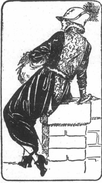
A novel black charmeuse frock opening at back and front over a straight fourreau of black and white broche silk.

The dress buttons right down the back, and down the front from the