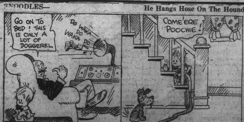
He Hangs On The Hound And Haunts Happiness.

Keep your walls iron well covered from dust, but do not wash it up very often, to prevent waffles sticking.