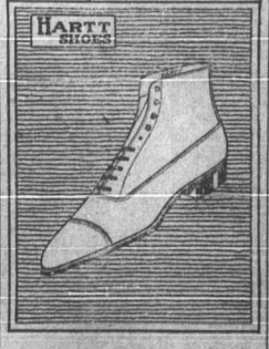
Shoes That Stay the Route