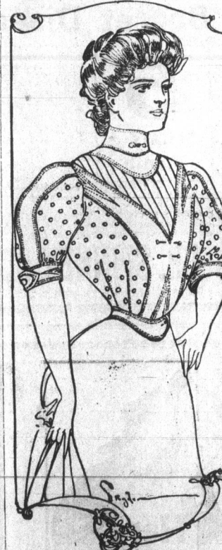
A SILK BLOUSE.

One of the newest shapes is an English walking hat with velvet crushed