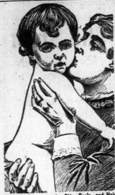
Pure and Sweet are the Skin, Soap, and Hair of Infants, Purified and Beautified by