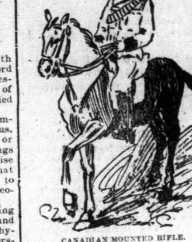
CANADIAN MOUNTED RIFLE.

the uniform adopted for the Canadian Mounted Rifles, which will soon number several thousand men if the plans of the Militia Department to convert a number of infantry corps into mounted ones and raise new regiments in the west are carried out. The coat is of the seal gray pattern as used by the Imperial troops, with cuffs, collar and shoulder straps of olive green cloth. The Sam Browne belt will be worn by the officers, and the bandolier and belt by the men. These will carry about 100 rounds of ammunition. The rough rider hat, turned up at one side, is of grey felt, with a tan leather strap to go under the chin. The breeches are khaki Bedford cord. Tan riding boots complete a modest yet effective uniform.