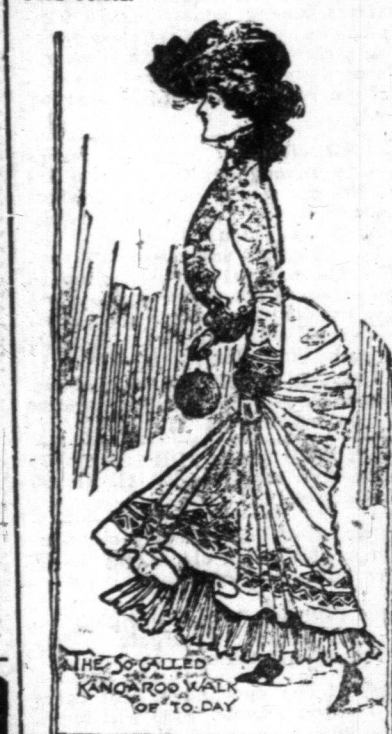
Fashionable girls seem to grow taller now than in other days, and it is the tall girl that carries off the forward bend and the "kangaroo" walk most effectively. Its popularity may be traced partly to the cultivation of the fad and partly to the affectation of an attractive young actress who carried it with her from the stage to Fifth Avenue, where it won the commendation of the men and the envy of the women. If imitation is the sincerest flattery, then the young woman from staidland must have been overwhelmed by seeing her gait so generally copied. The dipped belt was seized upon eagerly to accentuate the new figure. The waist line was kept well up in the back, as that is an indication of youthfulness, the physical culturists say, but in front the dip deepened until there was no waist line at all, only an inward curve extending downward from the protruded chest.

Fashions and customs move in cycles. Here we are harking back to the much ridiculed "Grecian bend" of thirty years ago. Look on this and then on that, a faithful representation of the figure, pose and costume fashionable in 1870 and of that of the smart young woman of to-day. The large bustle and the hunched up drapery in the back of the skirt are not duplicated, but the dipped belt, the forward incline and the "kangaroo walk" emphasize the resemblance to the bend our mothers affected. The walk really is the chief feature. To acquire it girls spend hours in the fashionable gymnastics perfecting themselves in the "chesty" attitude, with the abdomen drawn in, the chest thrown out, hips well in place and shoulder blades flattened, the modish girl is ready to swing forward with the ungraceful but smart gait that brings out the curves of the bend in bold relief.