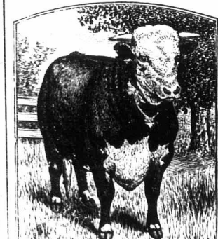
COMMODORE 32943. AT 18 MONTHS.