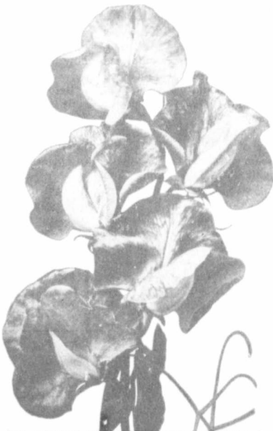
2583. RENNIE'S XXX SPENCER GIANT MIXTURE. Truly superb mixture of the fifty or more varieties of the Spencer type of Sweet Peas originated up to date. All are giants of striking beauty and delicacy of coloring, perfect in shape and vigor of growth. No other house can supply so grand a mixture. Lb. $3.25; 1/2 lb. $1.00; oz. 35c; pkt. 15c

394 Portage Ave., WINNIPEG 872 Granville St., Vancouver