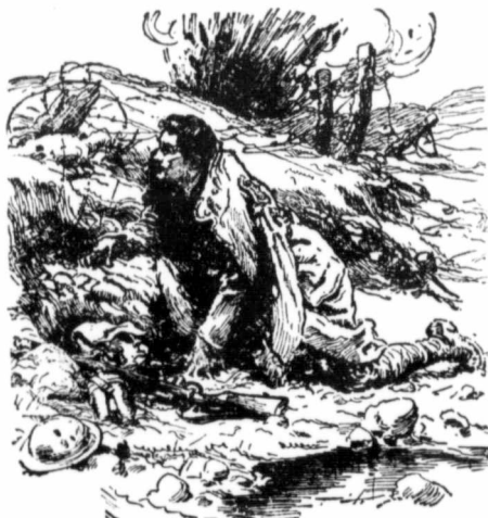
"Out in 'No-man's-Land' with no companionship save the everlasting jangle of hell's orchestra."