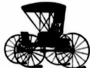
Buggy, No. 18. $50.

ALWAYS MENTION THE FARMING WORLD WHEN WRITING ADVERTISERS.