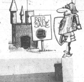
PORT CREDIT BUNGALOW

$44,000. This attractive brick home located convenient to transportation, schools and shopping, contains three bedrooms, living room, dining room, kitchen and 1½ baths. There are two fireplaces, one in the recreation room and one in the living room. For further information call Ken Hunt 274-1521.