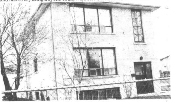
LARGE FAMILY HOME

Bungalow in quiet prestige area. Beautifully landscaped with trees and rose bushes. This two bedroom home is close to schools and "GO" Train and has everything anyone could wish for. Call Bill Hare 274-1521.