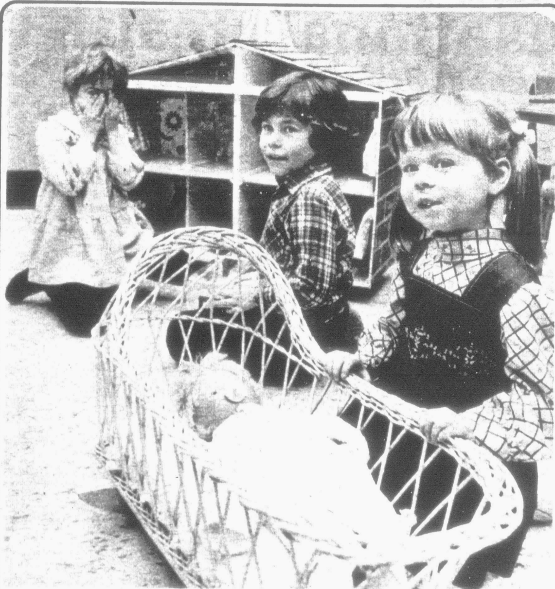
GODFREY BOOTH THE TIMES

Other programs offered by the "Y" this spring include judo, volleyball, horseback riding and yoga. For details about cost and locations call the "Y" at 275-3005.