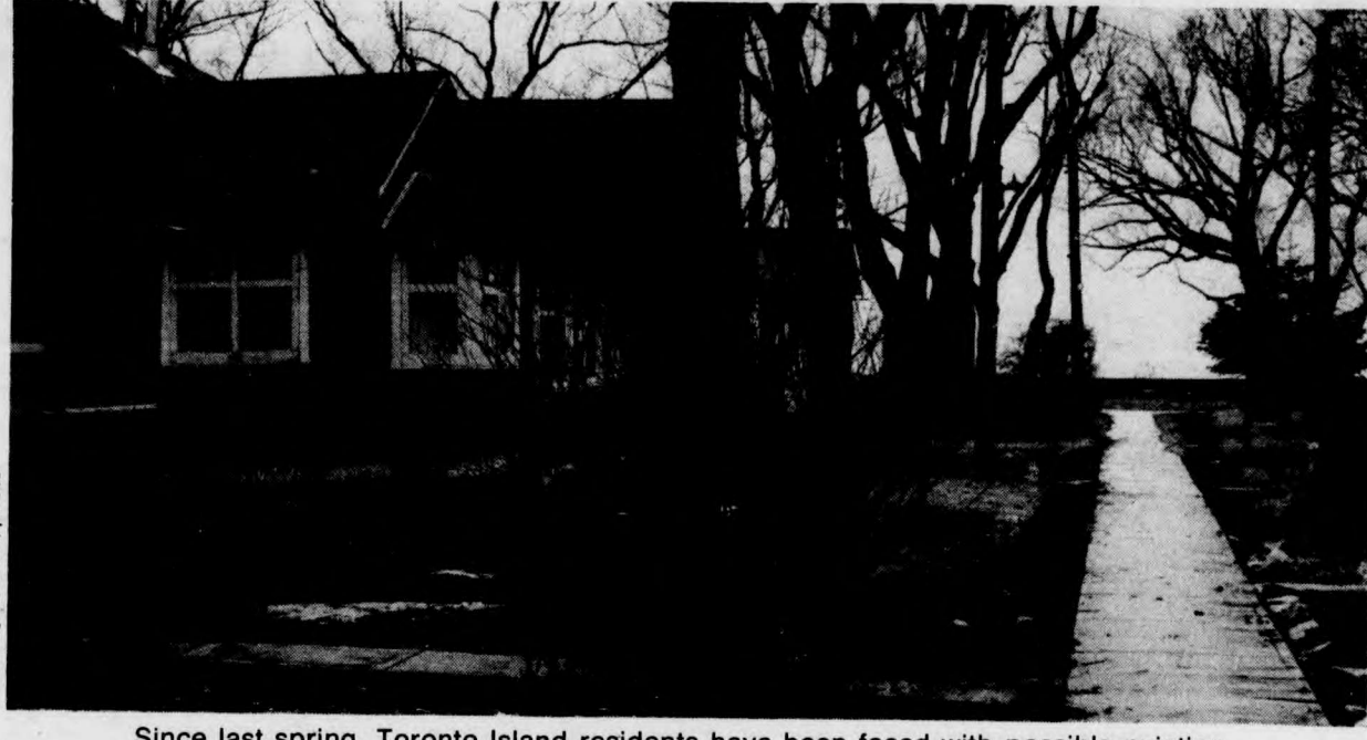
Since last spring, Toronto Island residents have been faced with possible eviction.

We talked for about an hour and as I left he said he hoped I wasn't bored. On the contrary, I told him that I wanted to hear people talk and get the feel of Islanders' life.