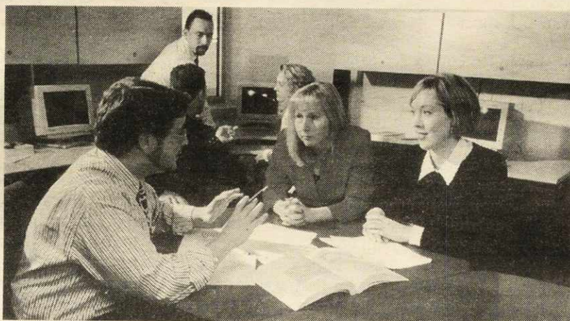
ITI students at work in rapid application development teams which simulate the IT workplace.

Atlantic Canadian high-tech companies have a voracious appetite for highly-skilled IT employees. ITI graduates are of particular interest to them. Thanks to ITI's innovative collaborative problem-solving environment, not only are graduates