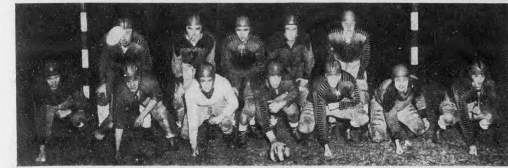
UNB Varsity Offensive Squad