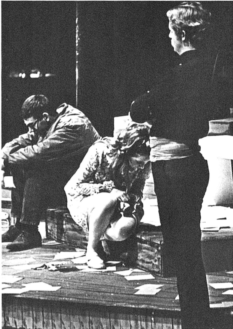
JUBILAIRES: After being cast out from Camrose Lutheran College, the Fantastiks is on tour; and back at the University Oct. 18, 19, 25, and 26.