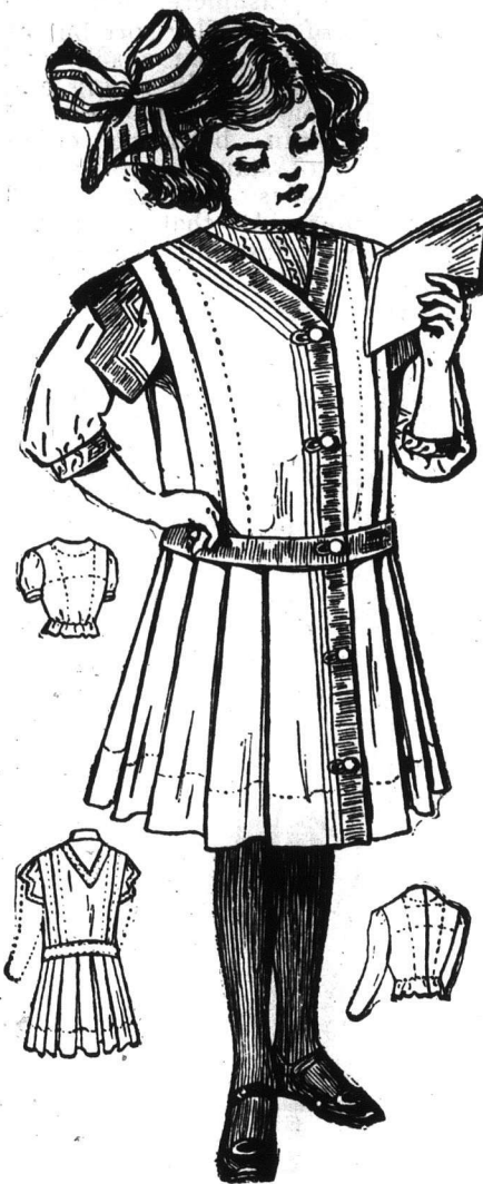
DESIGN B. MAY MANTON.

Cashmere makes a most charming dress for the younger girls and it is to be extensively worn throughout the autumn. This one is simple and girlish yet exceedingly smart and attractive. The color is one of the beautiful grayish blues and the trimming is silk banding while the guimpe is made of white muslin. The autumn has brought a long list of beautiful shades, however, and rose colors and dull greens are to be much worn, while there are reds that are beautiful in the extreme and brown is always practical and serviceable. Plaids too, are very beautiful and are always attractive for the earlier season and shepherd's check promises to con-