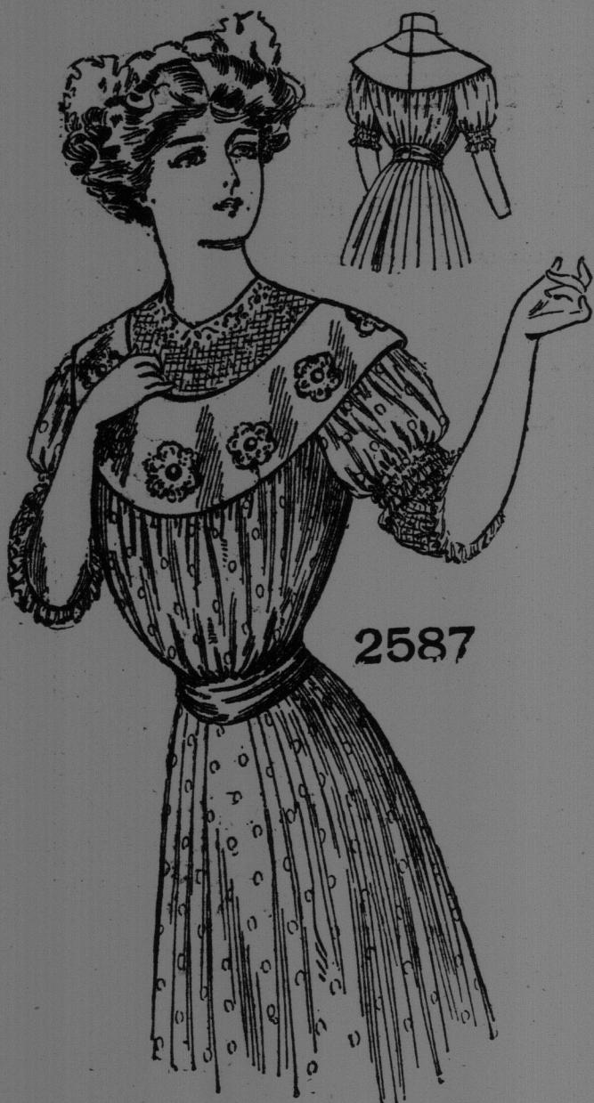
ONE OF THE NEW NET WAISTS.

2587.—The fashion lovers have taken up the dainty embroidered net which figures for the making of odd blouses. Here is shown one of simple style and real smartness which requires but a small amount of material and little time to make. The neck with its deep round yoke of plain Brussels net may be high or low round as shown while the sleeves with their single or double puffs may be long or end at the elbow. The suggestion offered here for the lower puff to match the material of the yoke is most effective. Any of the velvets, chiffon cloth, chiffon, lace or net organdie might serve for the waist as well as the net already mentioned. The medium size calls for 5½ yards, 21 inches wide.