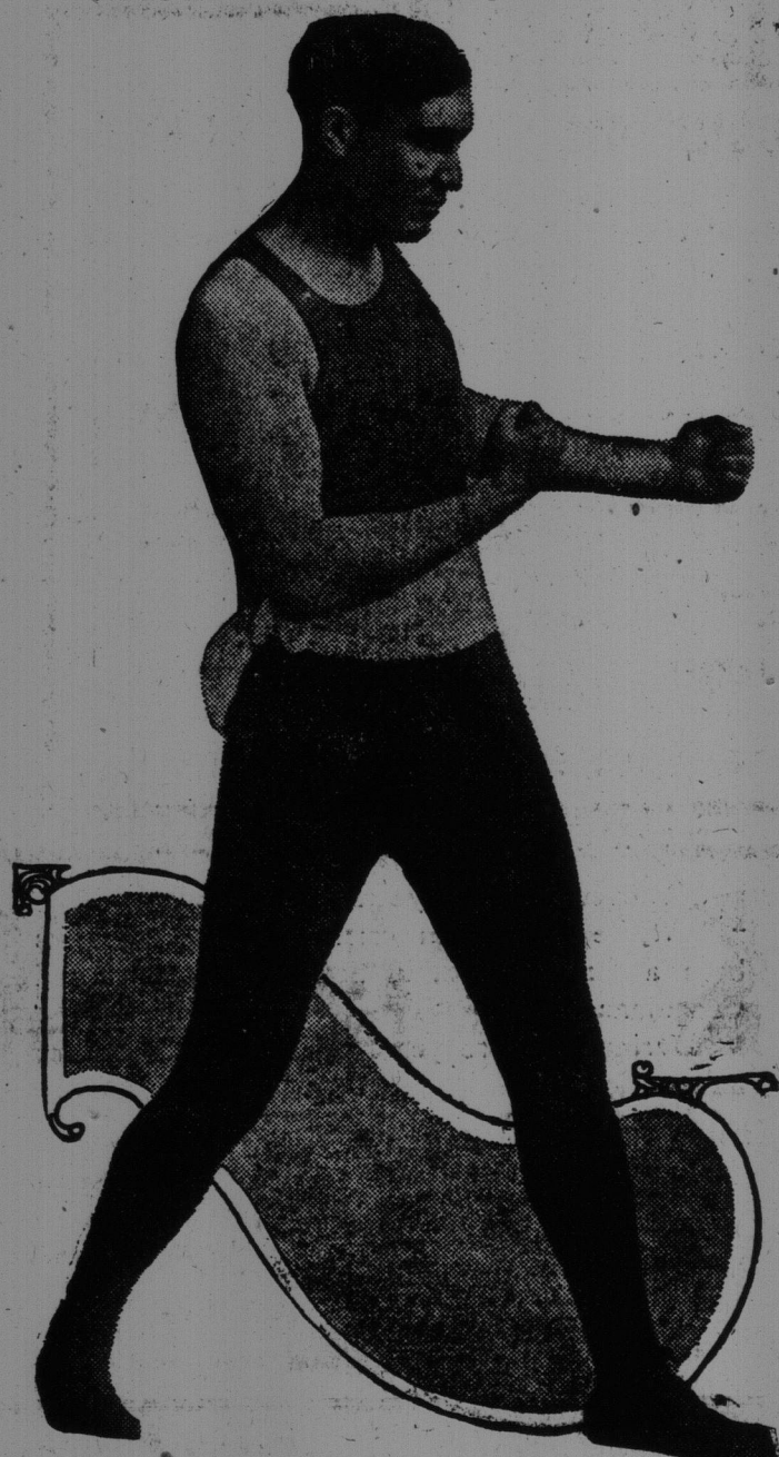
A recent photograph of Jess Willard, champion of the world, preparing for his fight with Dempsey on July 4.