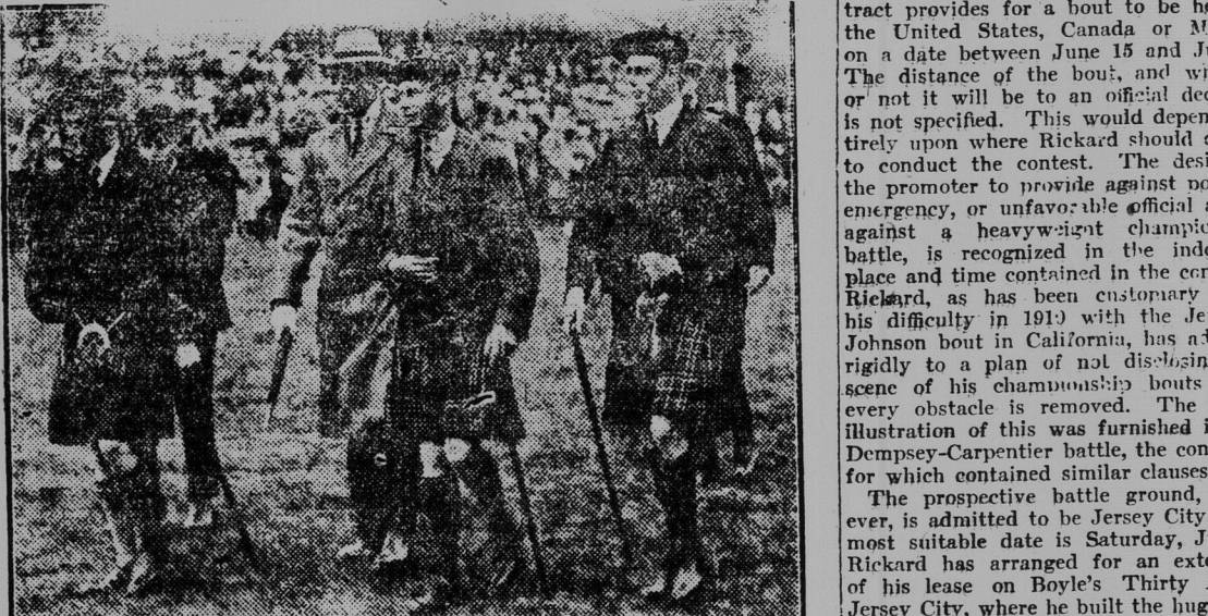
Photo shows the Prince of Wales, Marquis of Cambridge, the Duke of York and Prince Henry arriving at the famous outdoor gathering in Scotland. Athletics, dancing and other events were features.