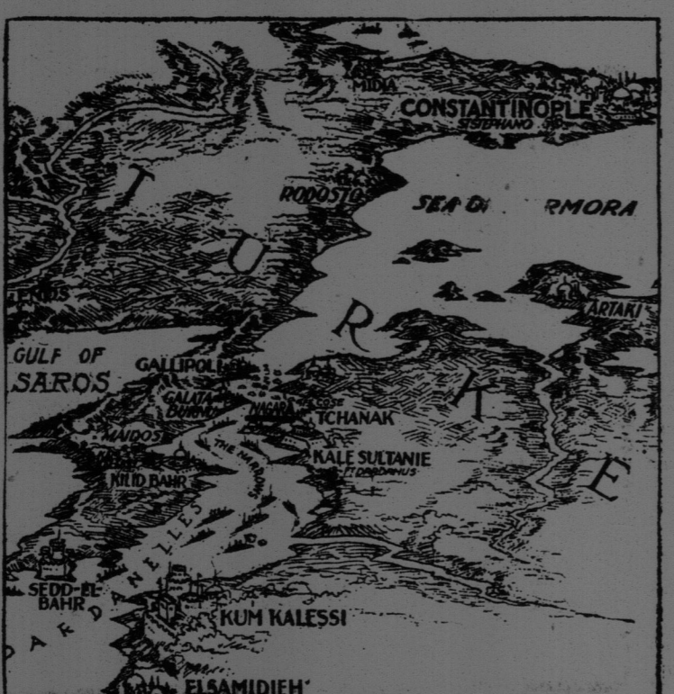
Despatches today from Constantinople admit that the allied ships have reached the narrow. Unofficial and unconfirmed report says the British cruiser Amethyst went as far as Fort Nagara and lost several men