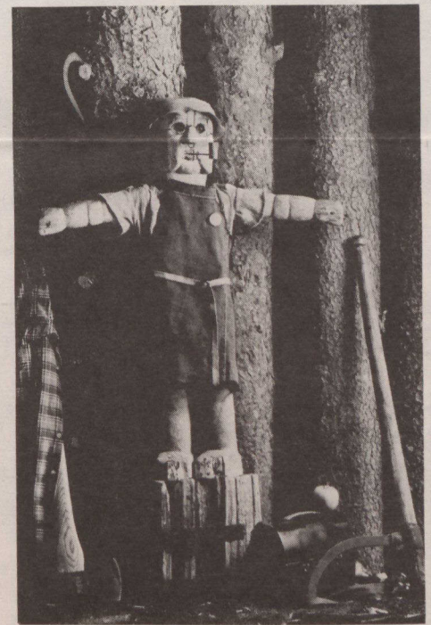
Clem, was originally used as a scarecrow.

After its showing in Calgary, From the Heart will travel to Saskatoon, Regina, Windsor, Edmonton, Vancouver, Charlottetown, Halifax, Winnipeg, Quebec City, Toronto and Montreal.