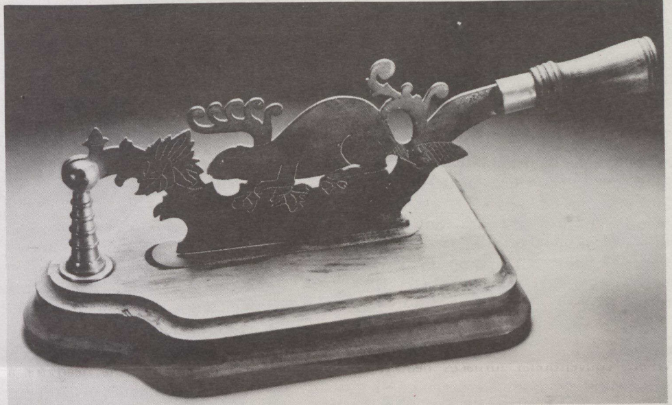
Wooden and metal tobacco cutter made by an artisan in Quebec.

The works included in the exhibition are drawn from the National Museum of Man's folk art collection, the largest of its kind in this country which includes the extensive Price, Sharpe and McKendry collections. This will be the first time such a significant selection of works from