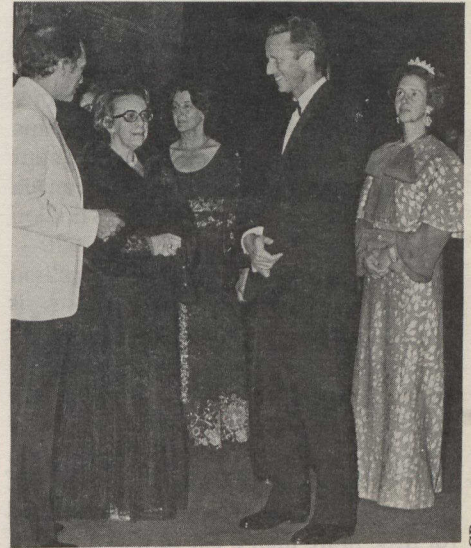
King Baudouin and Queen Fabiola (right) chat with Prime Minister Trudeau and Mrs. Léger, wife of the Governor General, at the National Arts Centre on September 20, where they saw a performance by the Royal Winnipeg Ballet.

The following day, the royal couple were in Quebec City and met with Lieute-