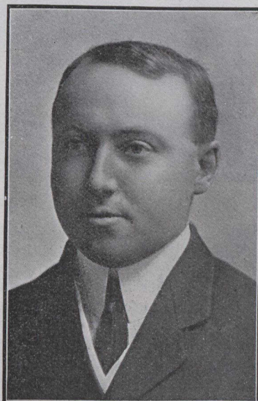
MAYOR F. E. HARRISON

17. Highways in Relation to City and Rural Municipalities.