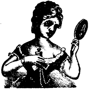
A skin of beauty is a joy forever.