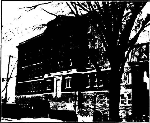
Christian Bros.' School, Longueuil, P.Q., recently completed. 18,000 square yards of SACKETT PLASTER BOARD were used in this building.

Architects in Canada are rapidly realizing the unequalled advantages of SACKETT PLASTER BOARD over both wood and metal lath, for various reasons:—