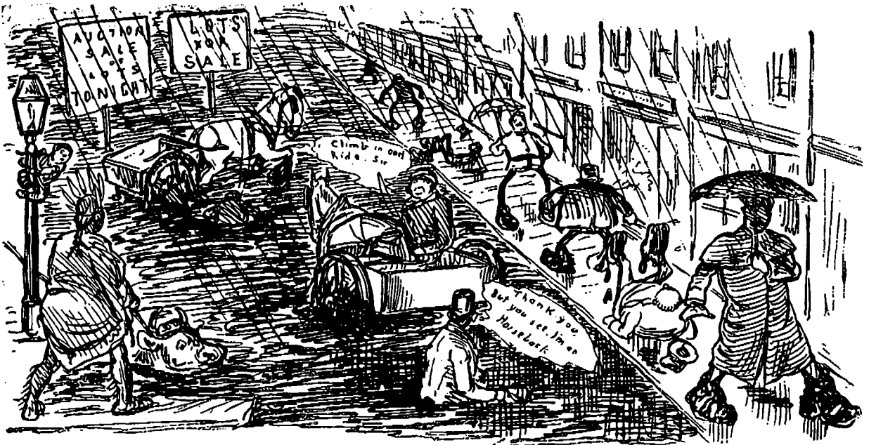
WINNIPEG DURING THE RAINY SEASON.