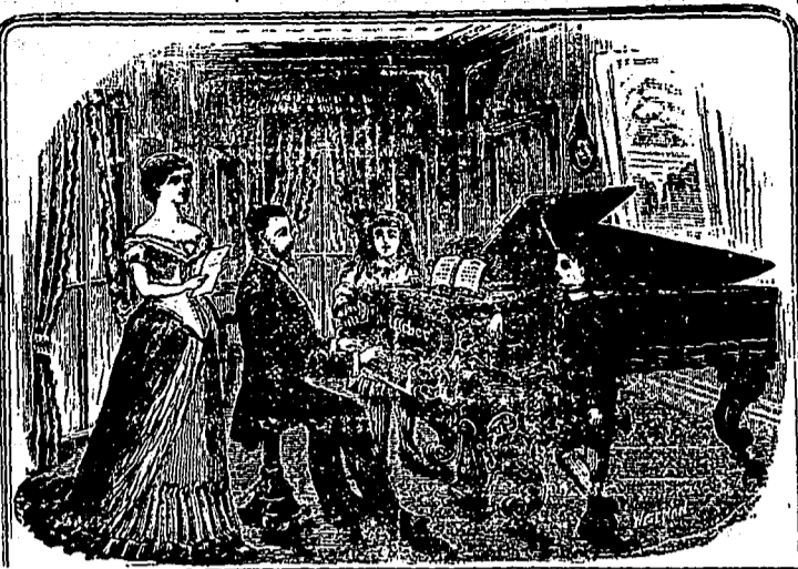
THE WEBER BABY GRAND. RECEIVED HOME.